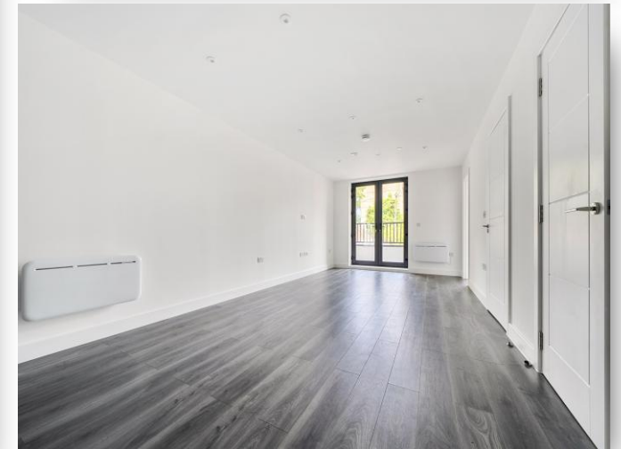
4 Brunel Place, West Street, Maidenhead SL6 1LG