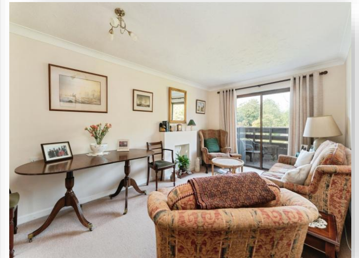
Ship Gardens, Mildenhall IP28 7DL