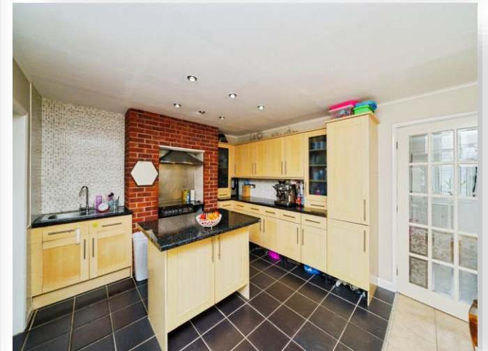
Bebington Road, Bebington, Wirral CH63 7NT