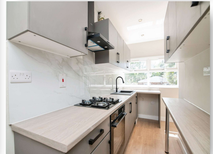
Wensleydale Road, Birmingham B42 1PJ