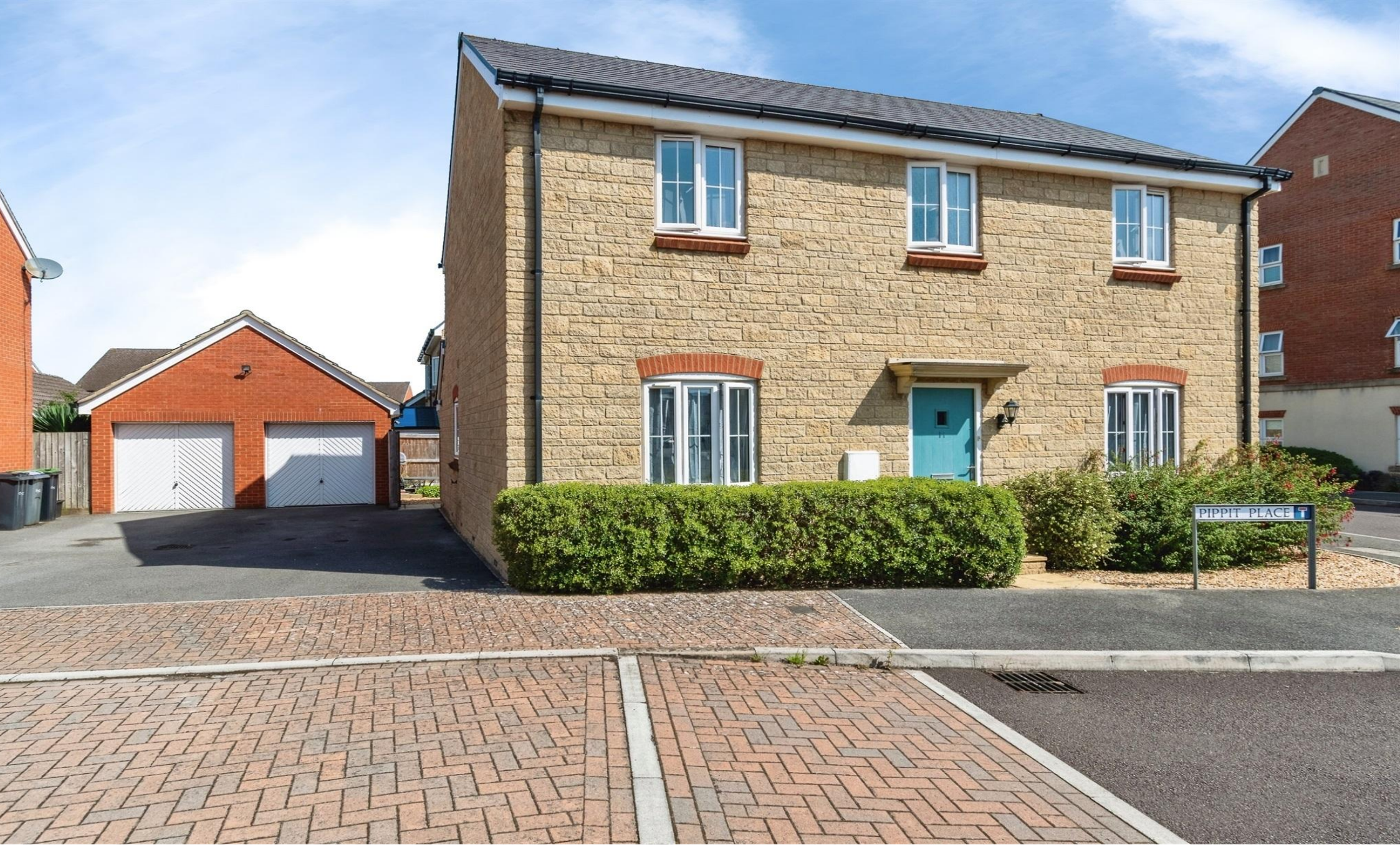
Pippit Place, Melksham SN12 7GA