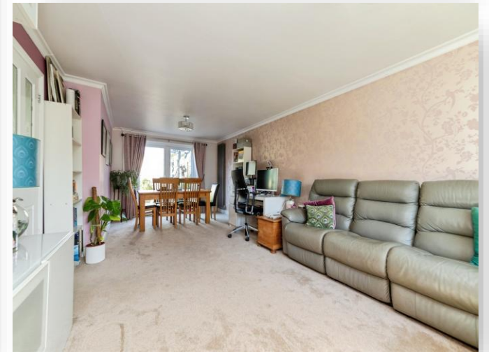
Hockerill, Watton At Stone Hertford, SG14 3SQ