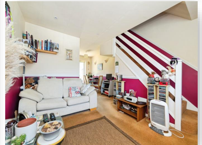
Ladywood Road, Hertford, SG14 2TB