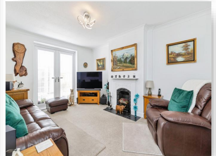
Central Avenue, Billingham TS23 1LW