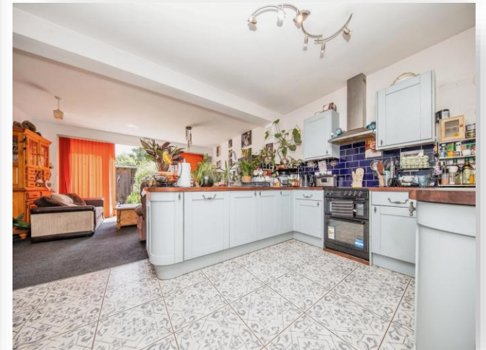
Wherstead Road, Ipswich, IP2 8LW