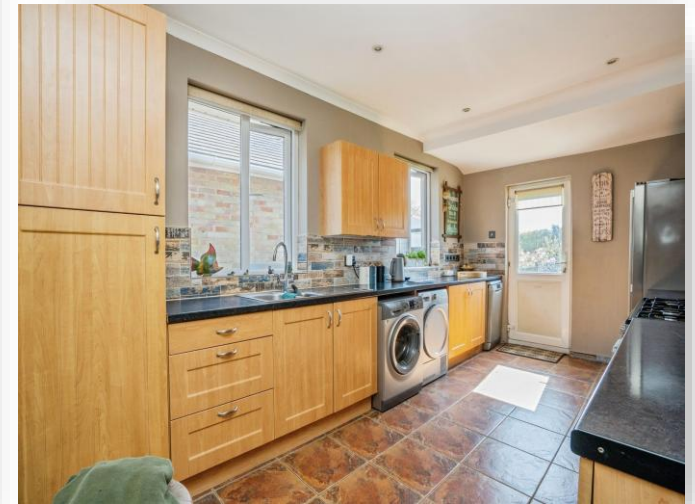
Elmwood Avenue, Waterlooville PO7 7LG