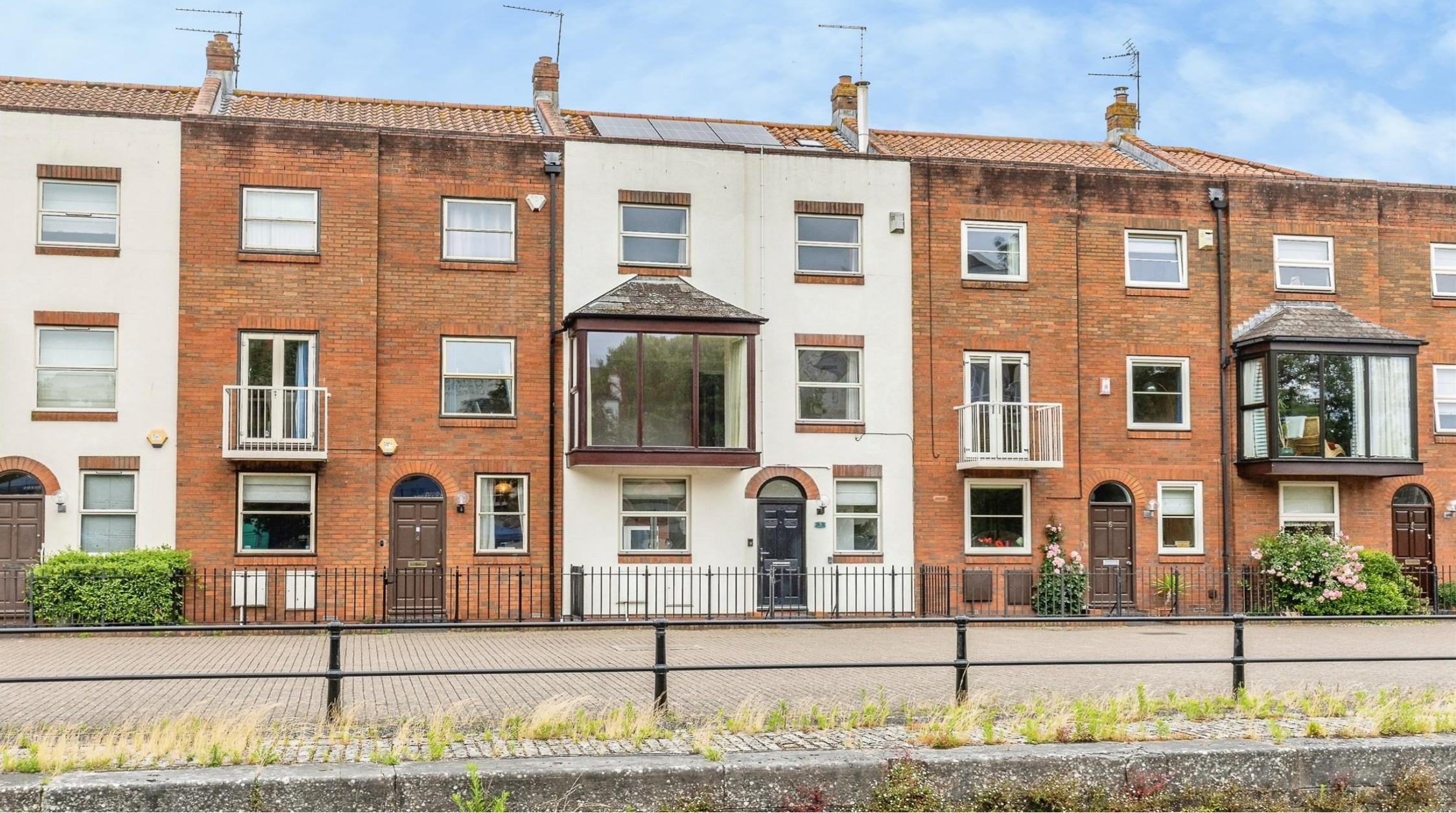
Trin Mills, Bristol BS1 4RJ