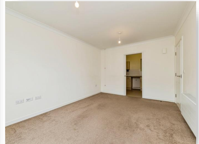
Hartfields, Hartlepool, TS26 0US