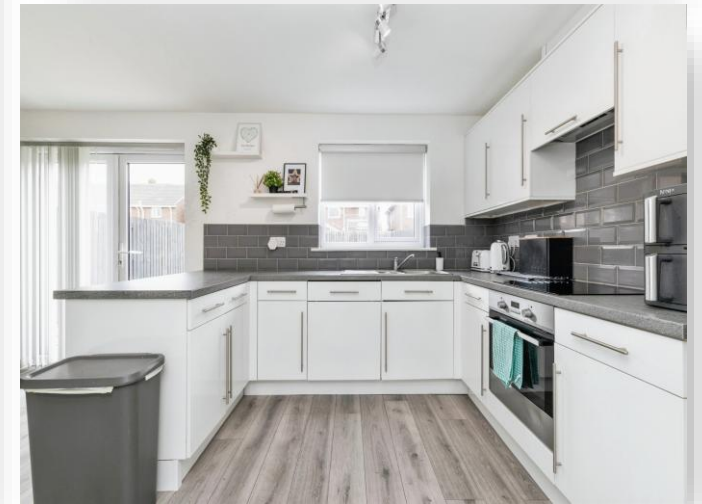
Vickers Lane, Hartlepool, TS25 2DN