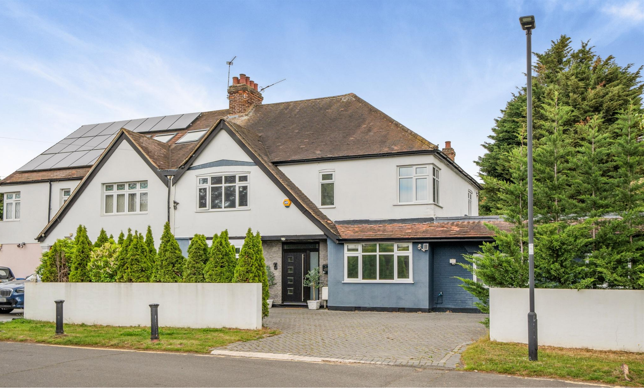
The Ridgeway, Enfield, EN2 8JR