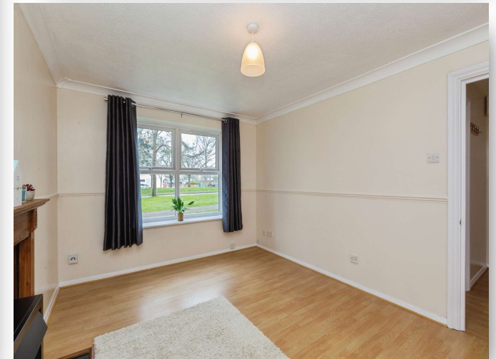
Whinchat, Watermead Aylesbury HP19 0WA