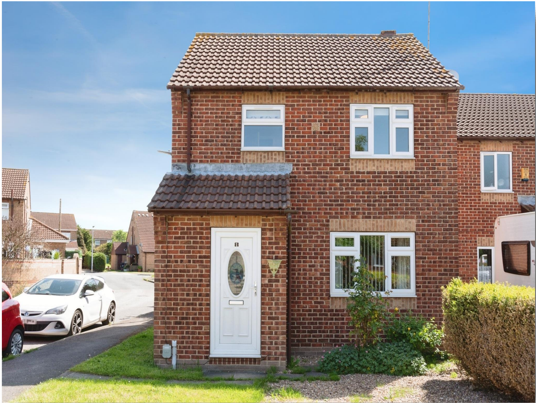
Emberton Park, Kingswood, Hull, HU7 3EP