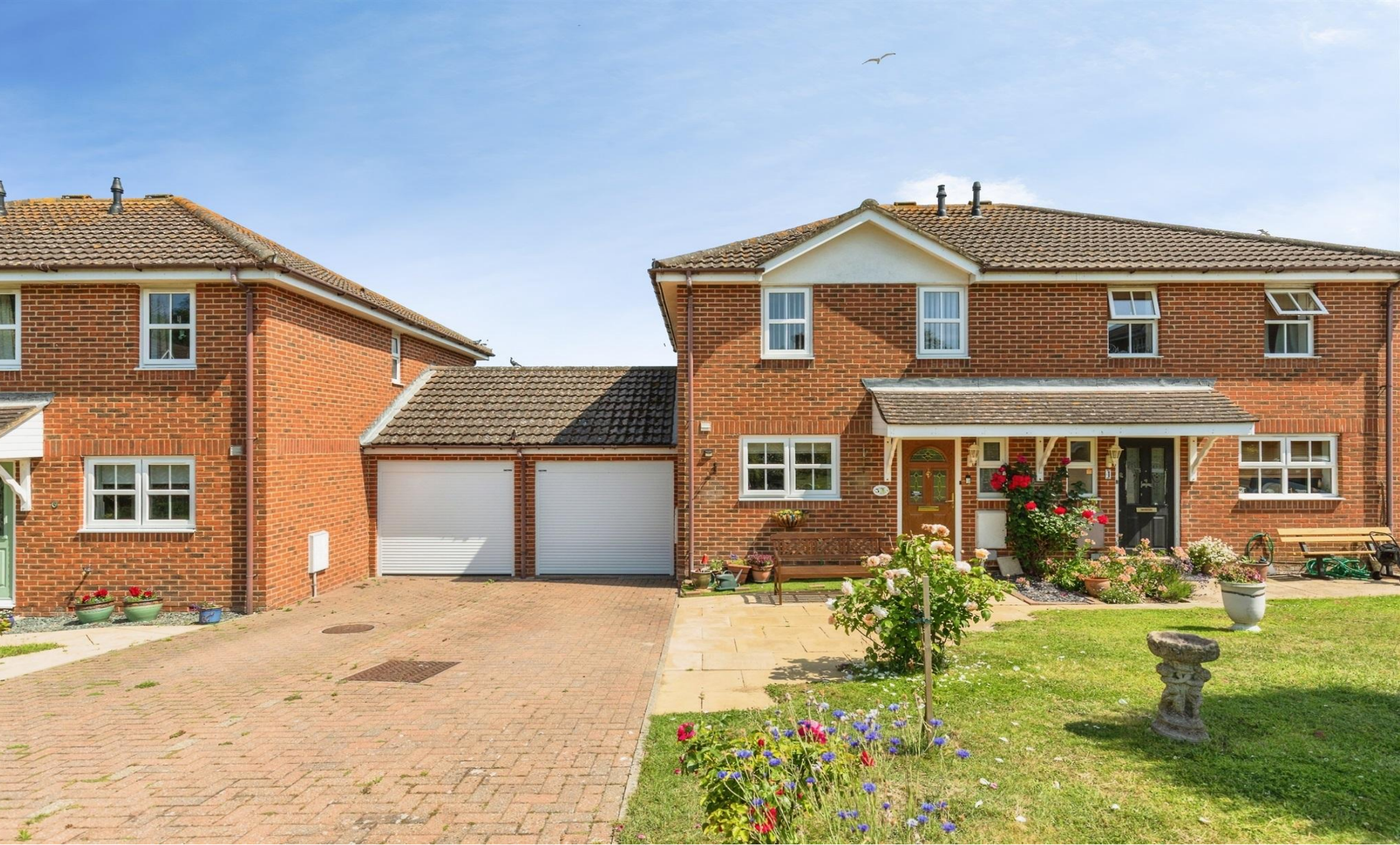
Ellis Close, Hastings TN34 1RB