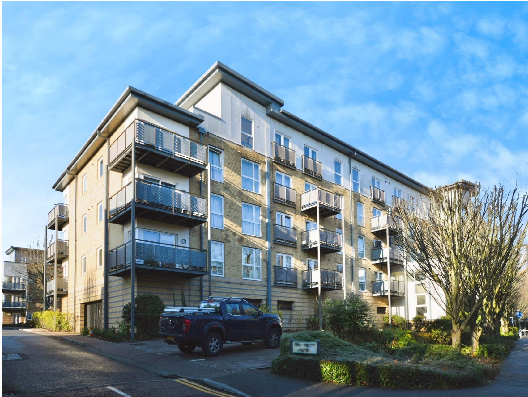
Westmount Apartments, Metropolitan Station Approach, Watford, WD18 7BE