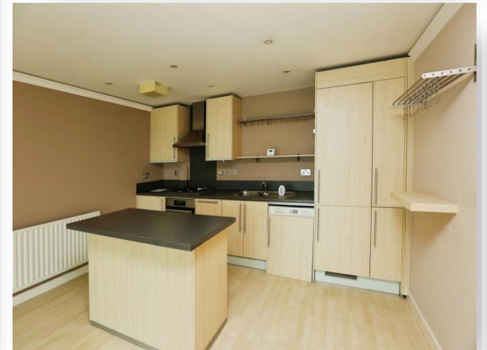
The Quarterdeck Gosport, Marina, Mumby Road Gosport PO12 1AL