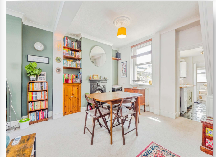
Arabella Street, Roath Cardiff CF24 4SW