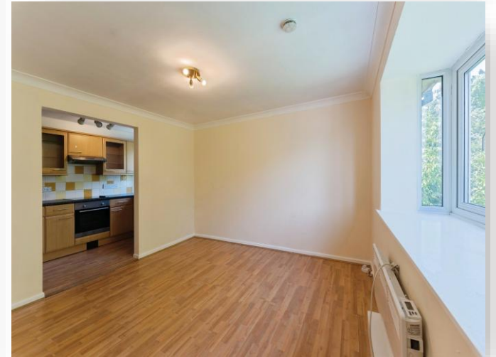
Village Court, Village Road, PRENTON, CH43 6XN