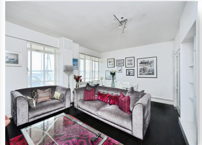
Embassy Court Kings Road, Brighton BN1 2PX