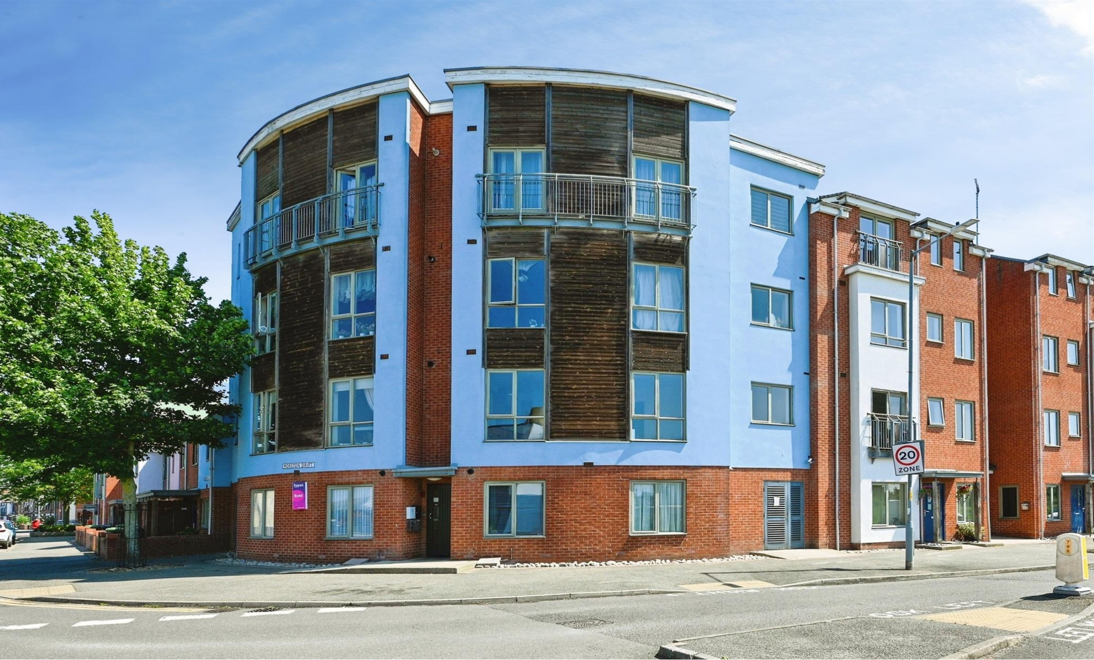
Morston Drift, King's Lynn, PE30 5GA