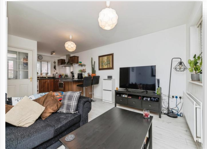
Geranium Close, Billingham TS23 2BY