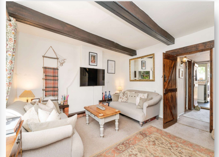
Pepperpot Cottage, Playingfield Drive, Whissonsett Dereham, NR20 5ST