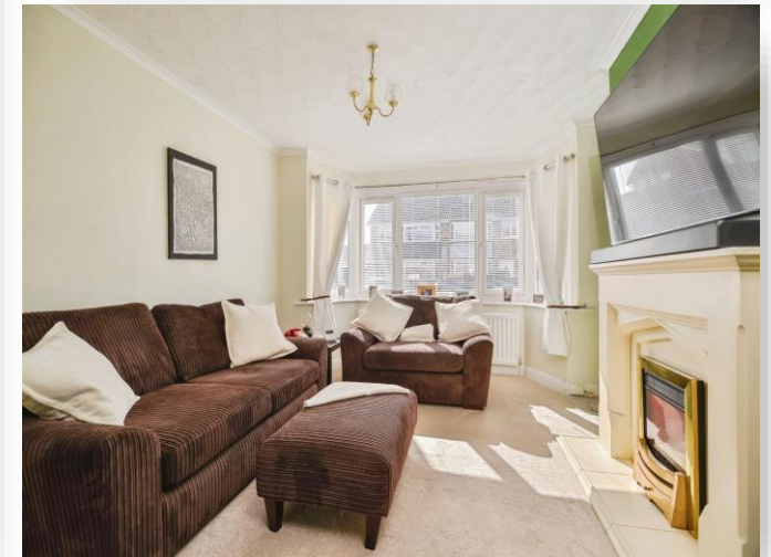
Rimswell Road, Stockton-On-Tees TS19 7LH