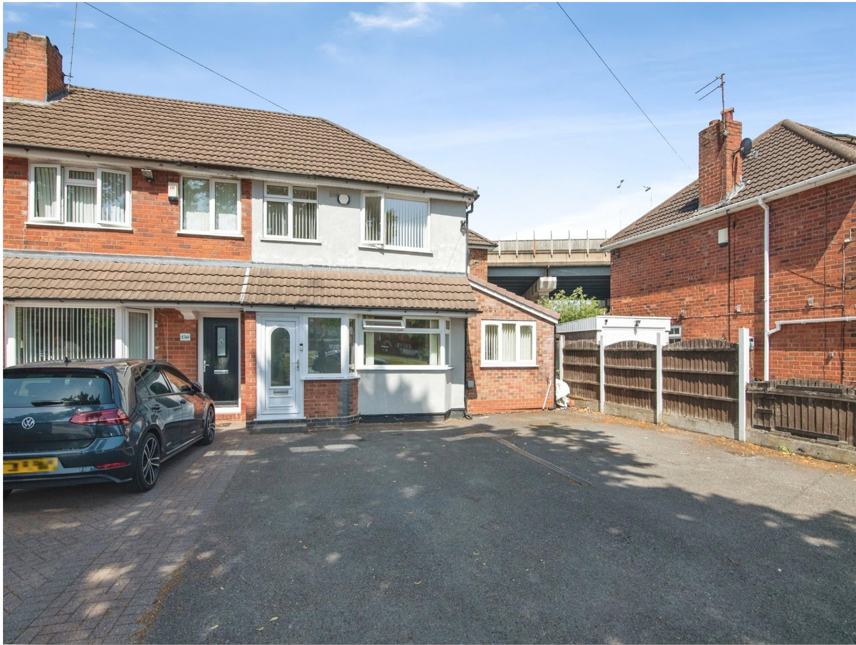
Thornbridge Avenue, Birmingham B42 2AE