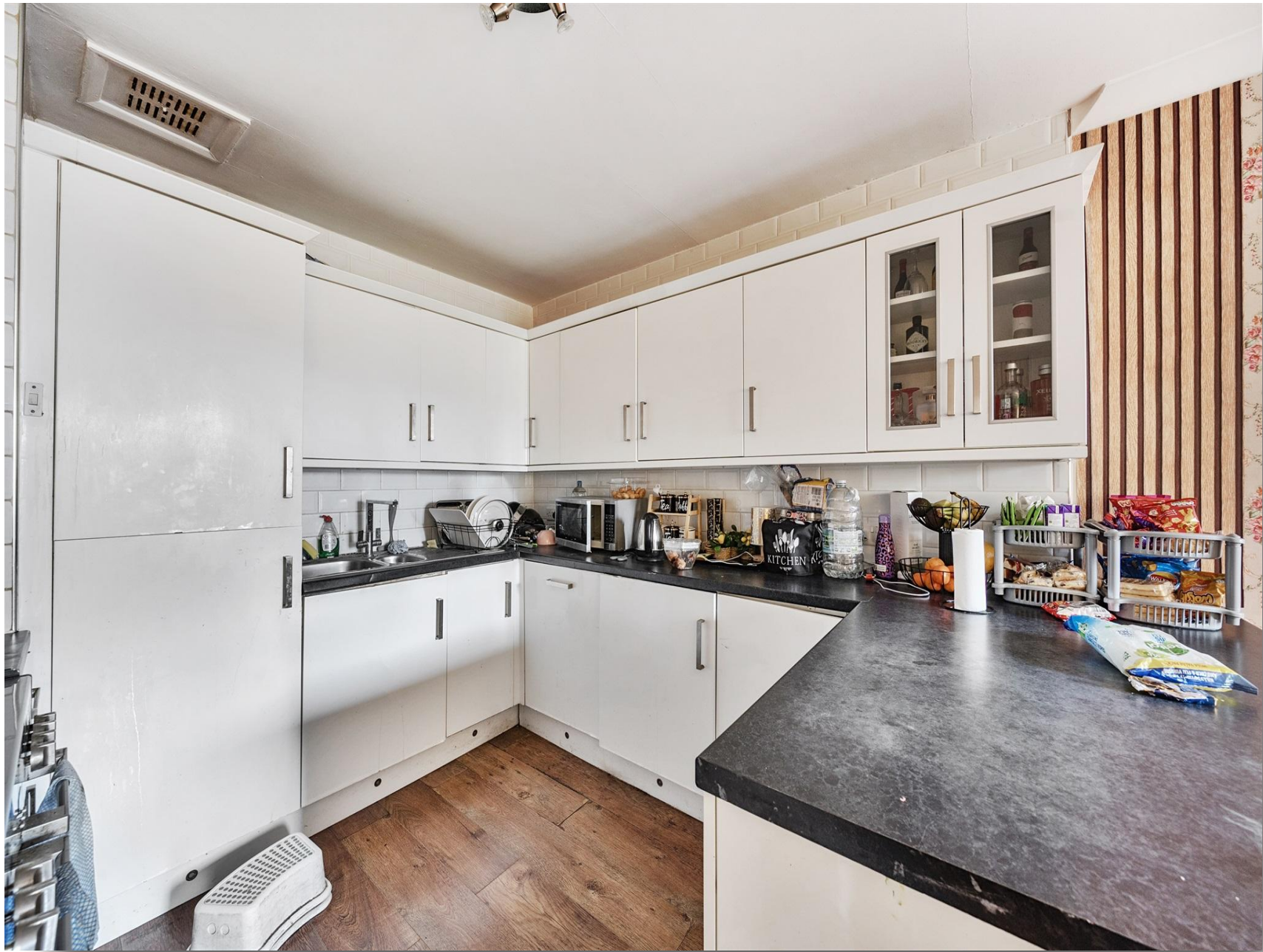
10 Glynwood House, Bridge Avenue, Maidenhead SL6 1RS