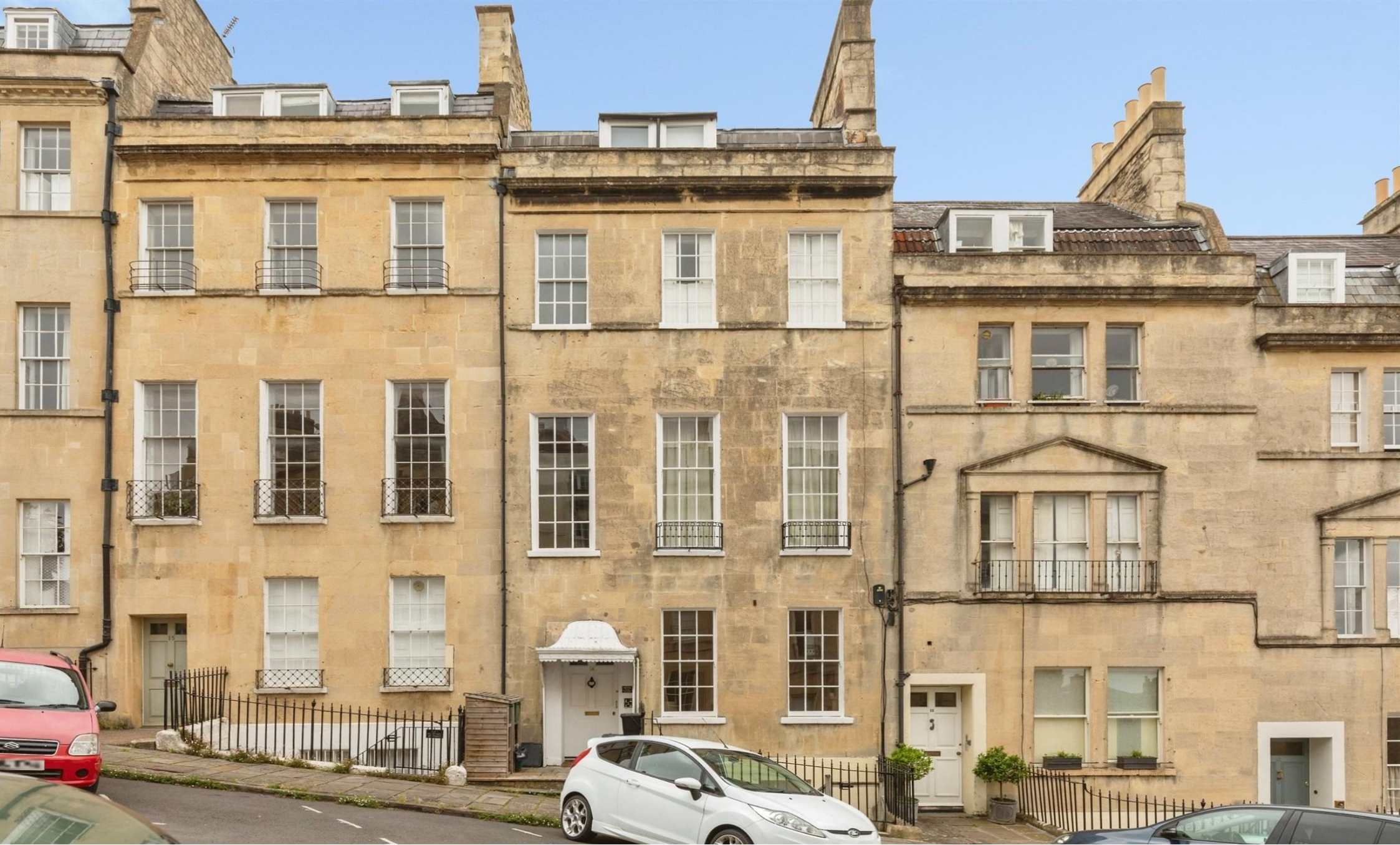
Burlington Street, Bath BA1 2SA