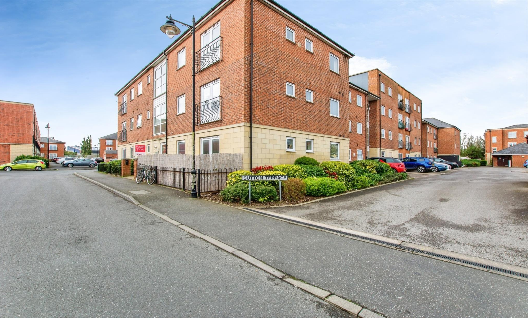
Sutton Terrace, Boston PE21 8GE