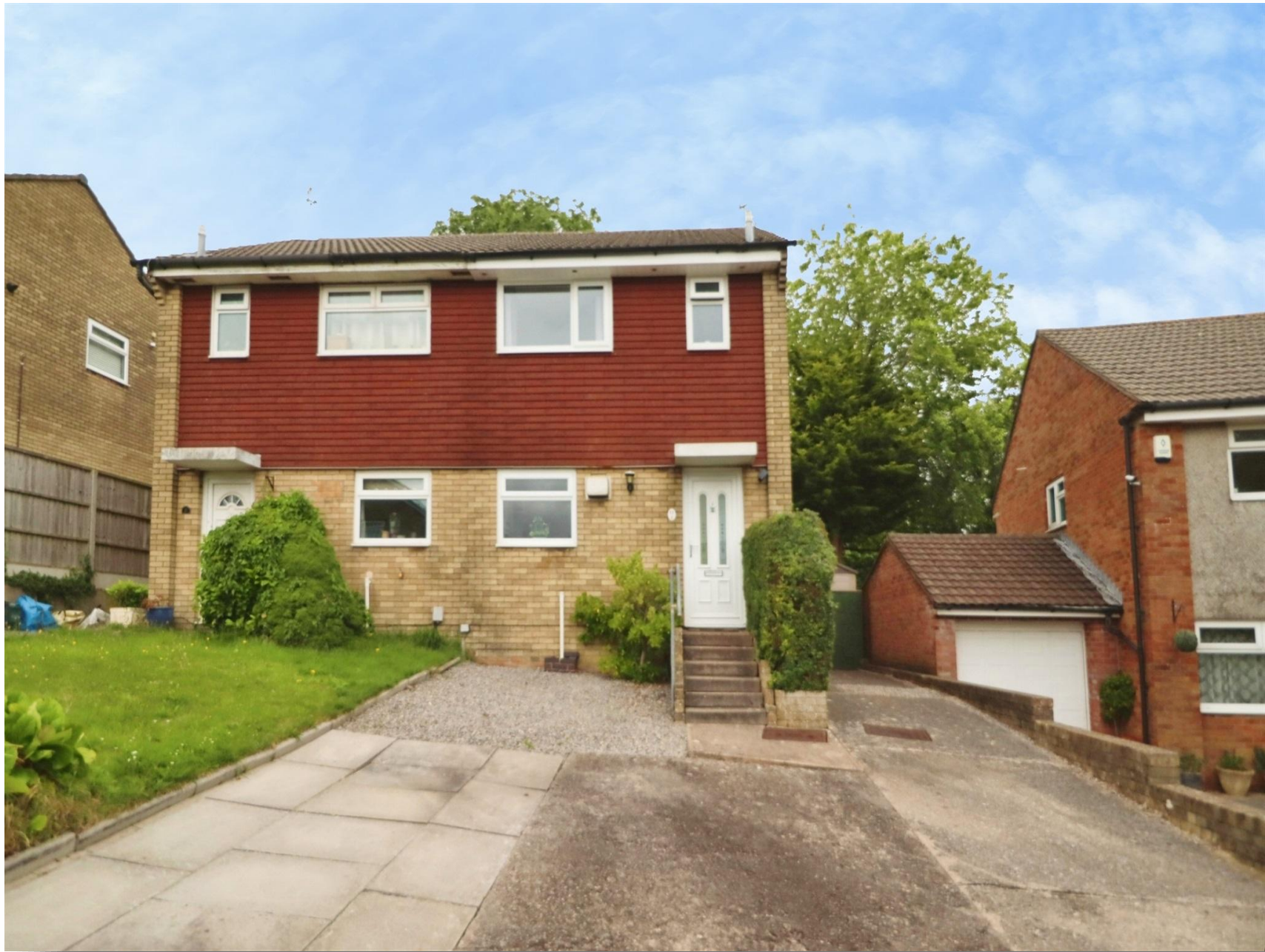
Lydstep Road, BARRY CF62 9EA