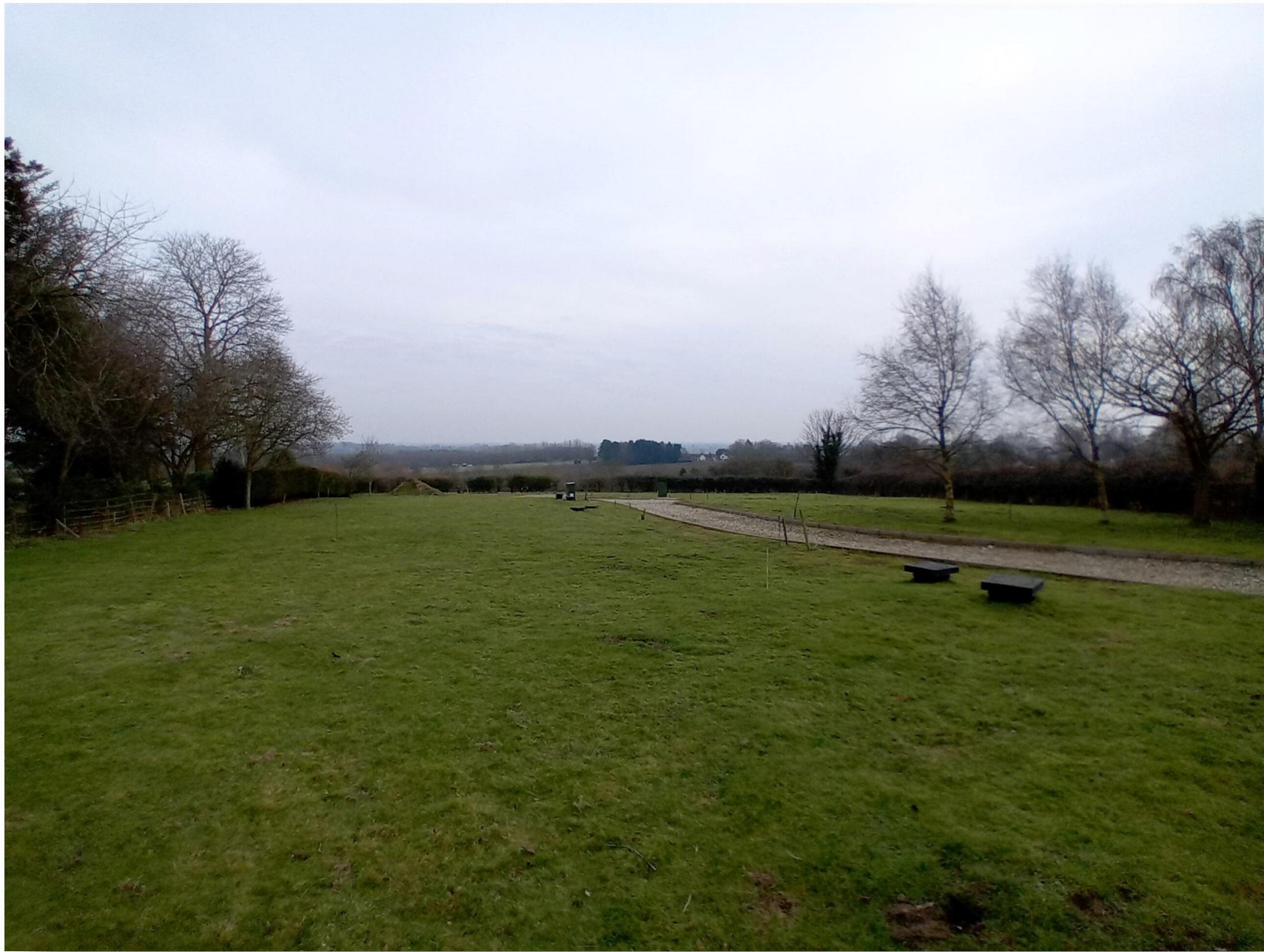
Land Main Road, Toynton All Saints Spilsby PE23 5AE