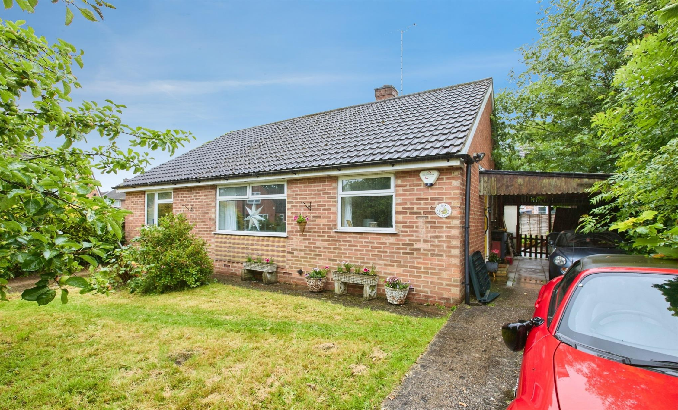
The Lawns Rolleston-On-Dove Burton-On-Trent