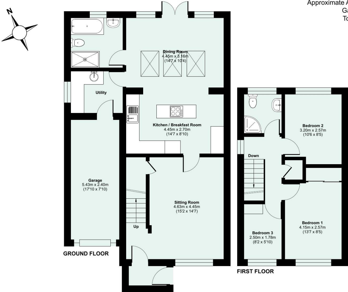
Floor plan produced in accordance with RICS Property Measurement 2nd Edition, Incorporating International Property Measurement Standards (IPMS2 Residential). © ncthecom 2026. Produced for Seddon Estate Agents LLP. REF: 1470916

Approximate Area = 1016 sq ft / 94.3 sq m Garage = 129 sq ft / 11.9 sq m Total = 1145 sq ft / 106.2 sq m For identification only - Not to scale