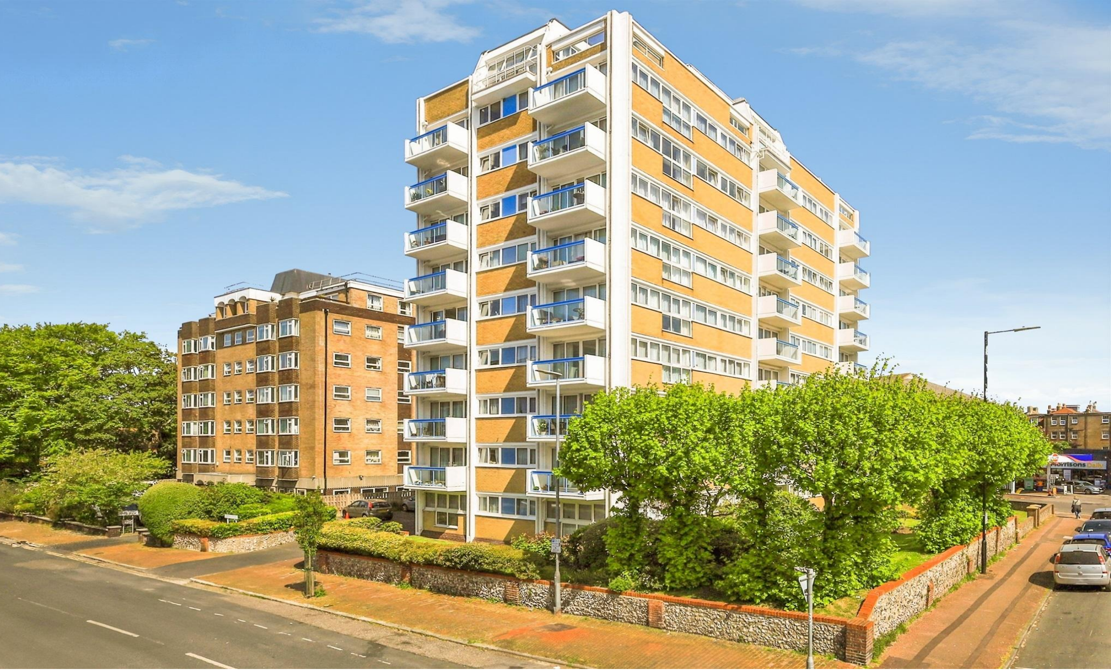
Gannet House Hartington Place, Eastbourne BN21 3BL