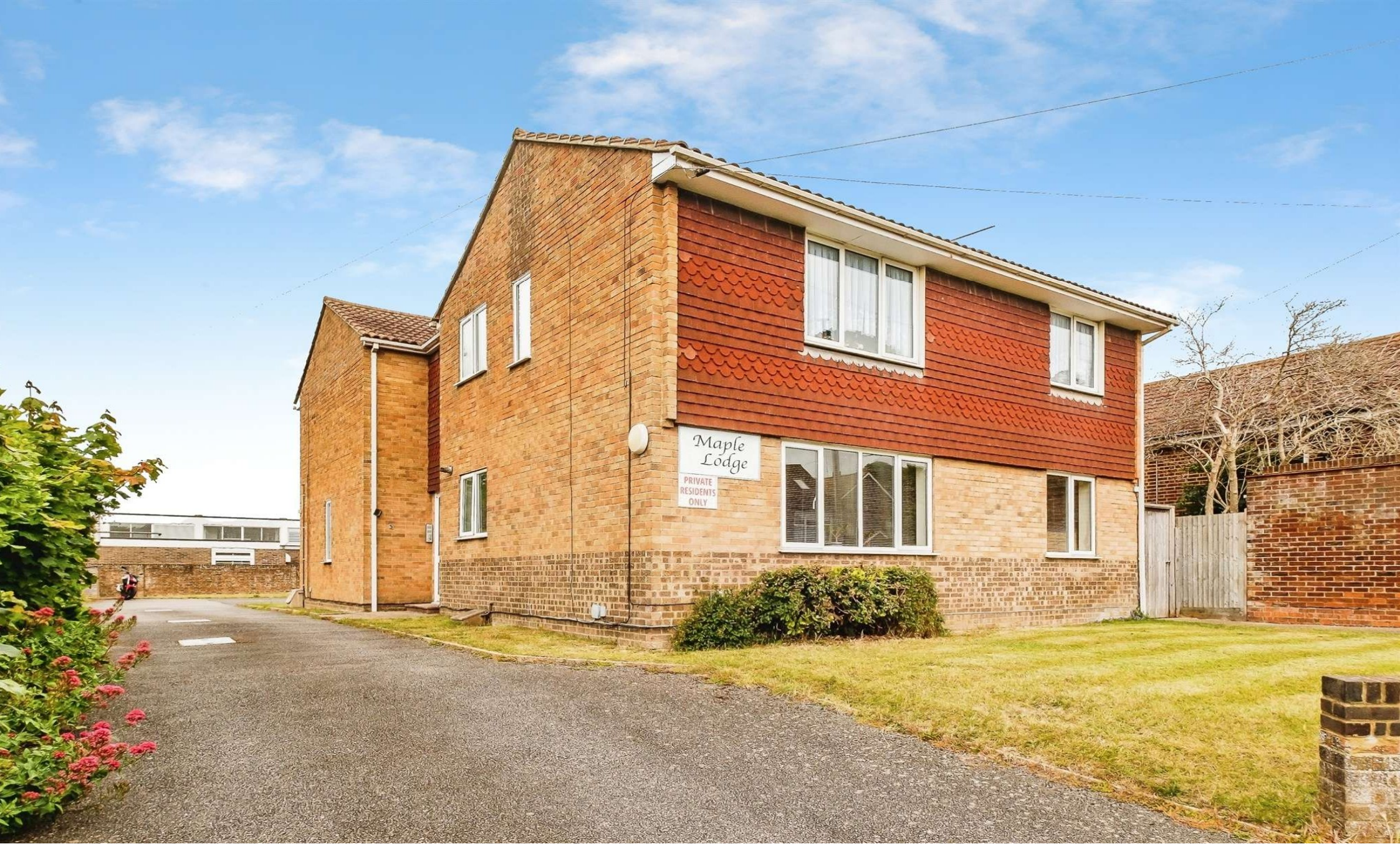
Maple Lodge Southwick Street, Southwick Brighton BN42 4AD