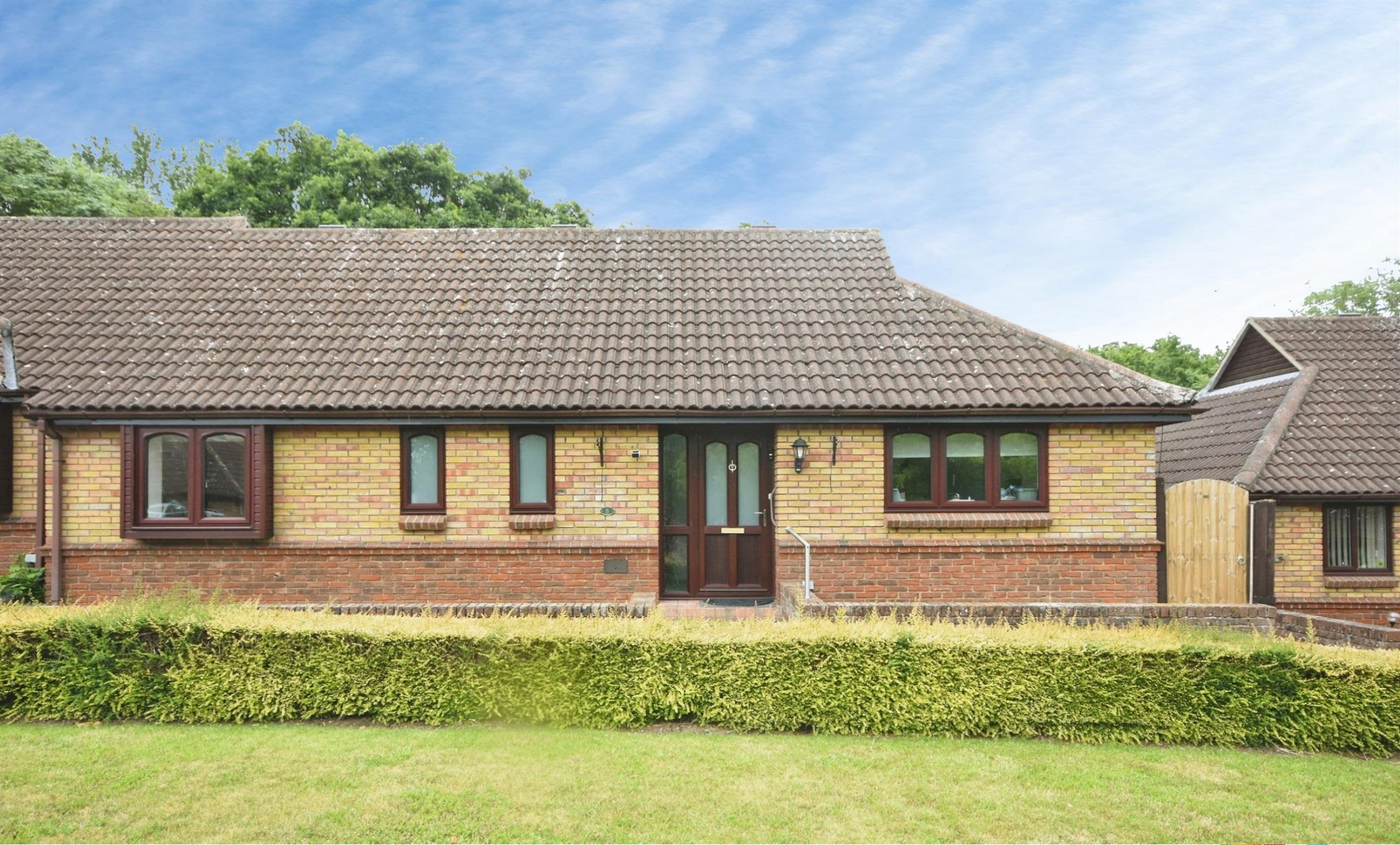
Alexander Mews, Sandon Chelmsford CM2 7TT