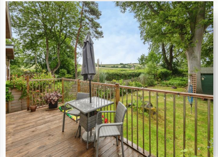
Cleeve Park, Chapel Cleeve, Minehead, TA24 6JF