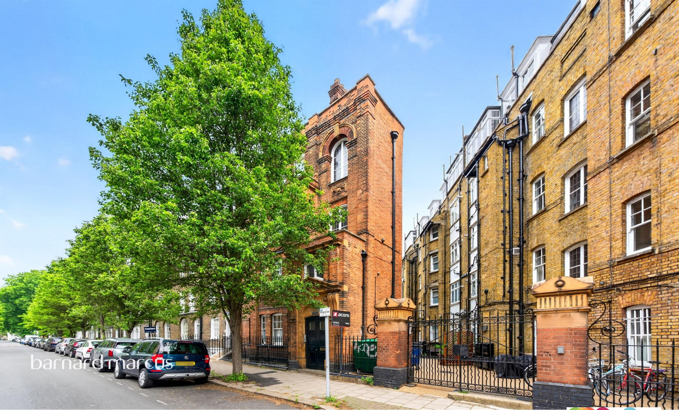
Walcot Gardens Walnut Tree Walk, London SE11