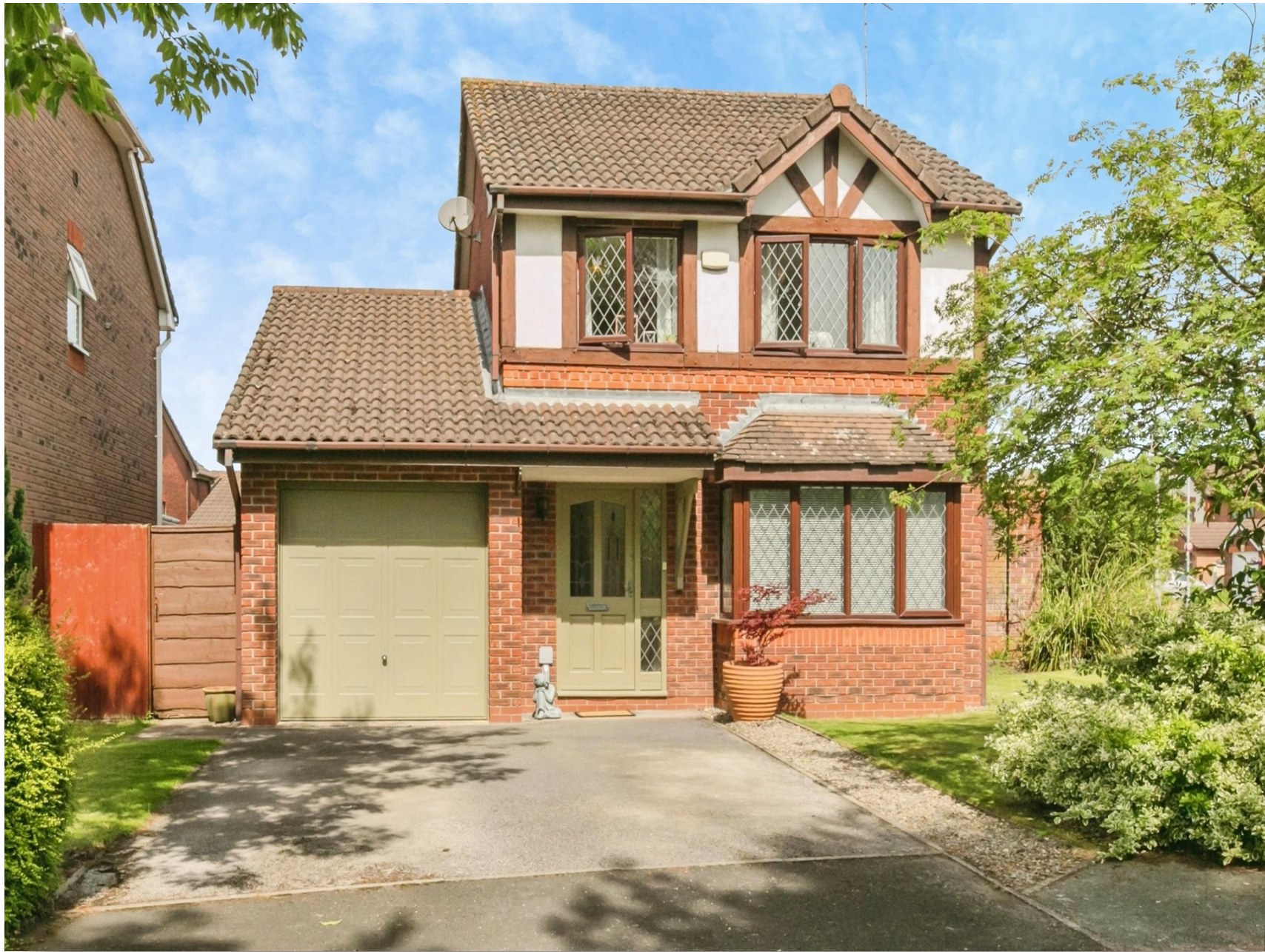
Churton Close, NORTHWICH CW9 8FQ