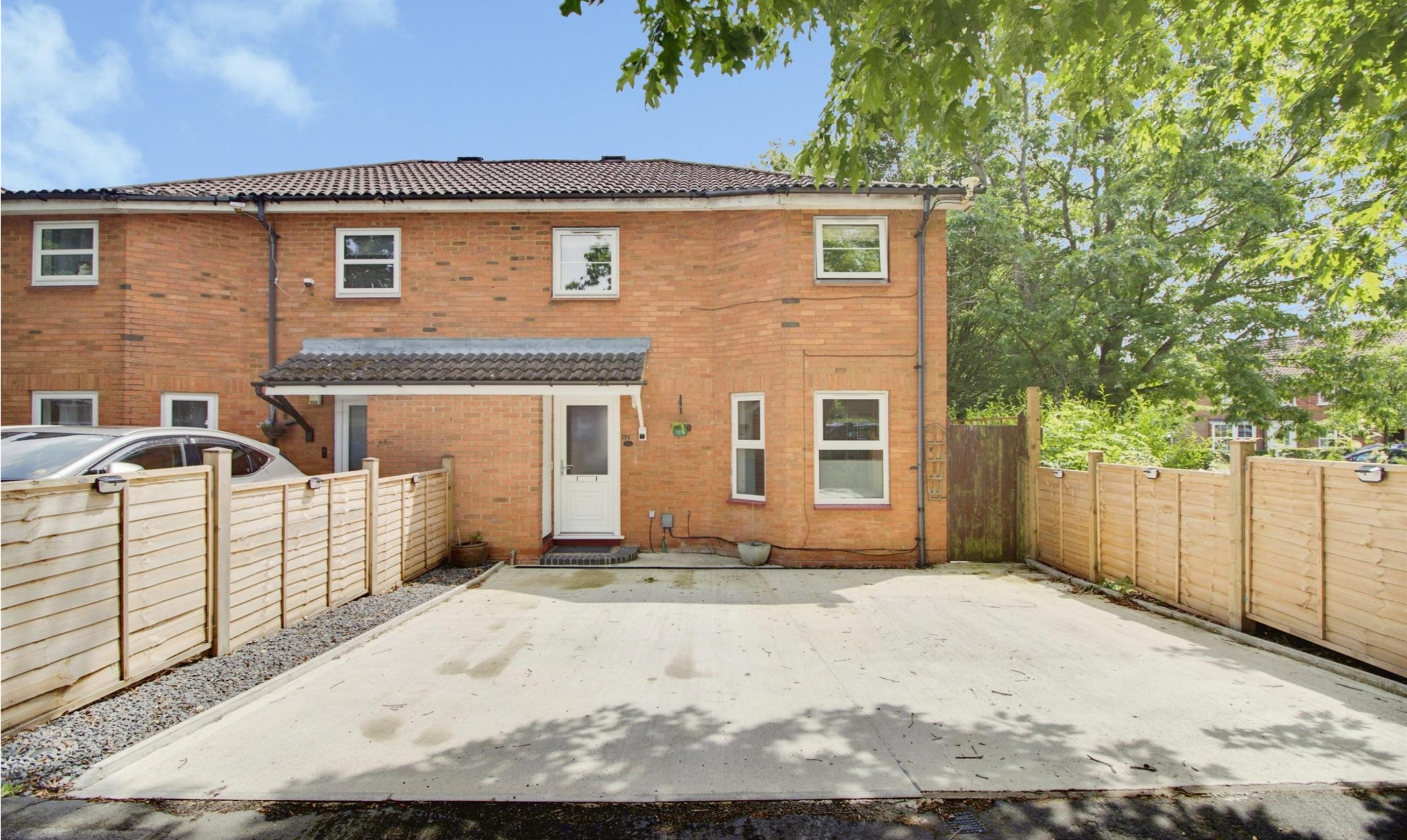
Peartree Lane, Welwyn Garden City AL7 3XL