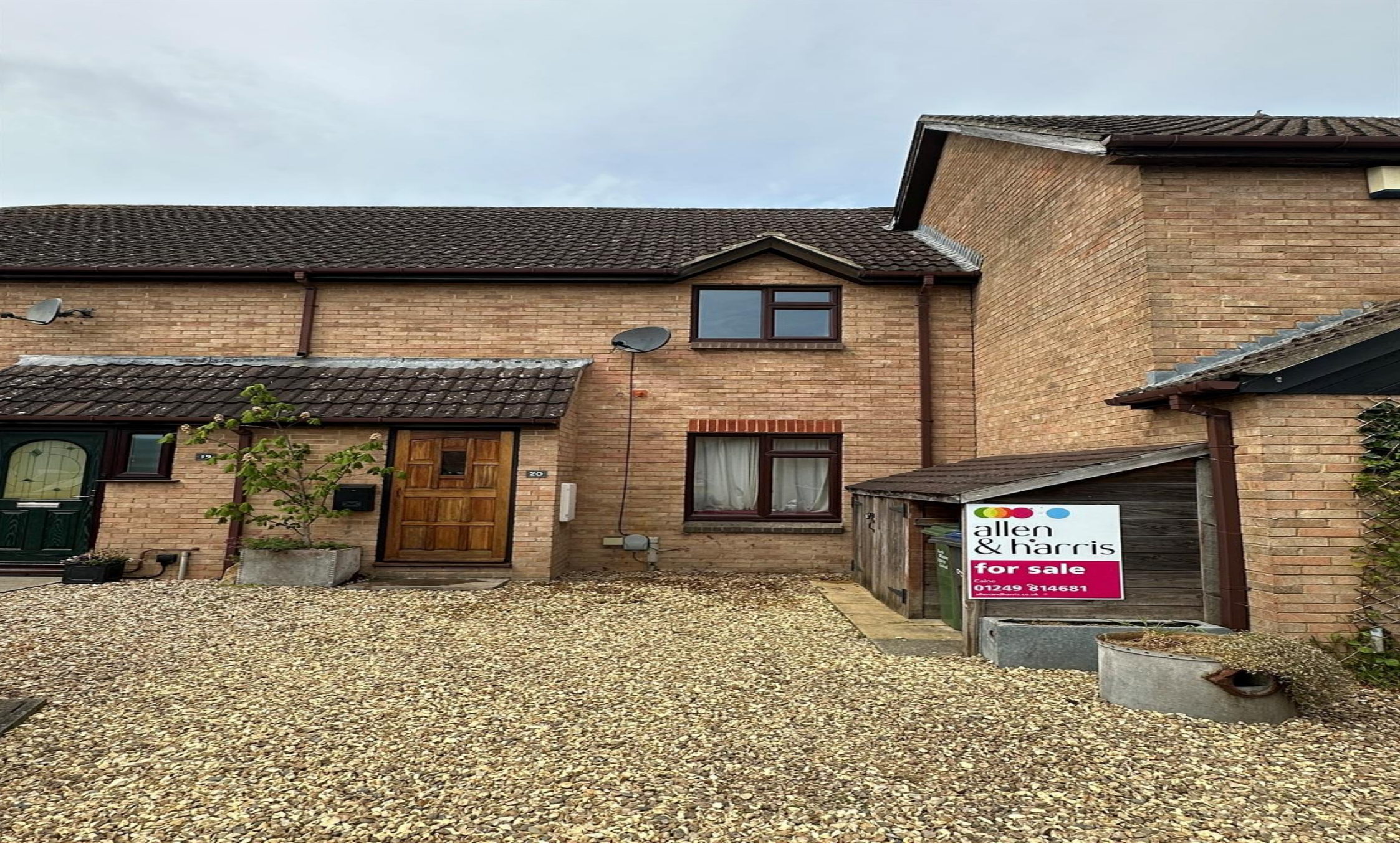
Guthrie Close, Calne SN11 9QA