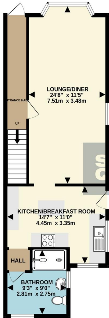
GROUND FLOOR 571 sq.ft. (53.0 sq.m.) approx.