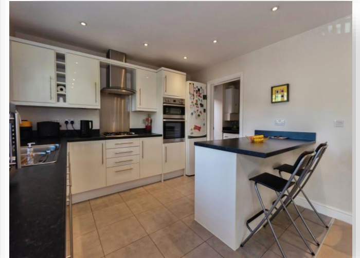
Howes Rise, BIRMINGHAM B29 5HW