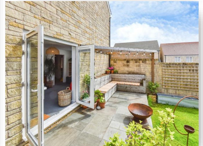
14 Lily Road, Frome BA11 5FQ