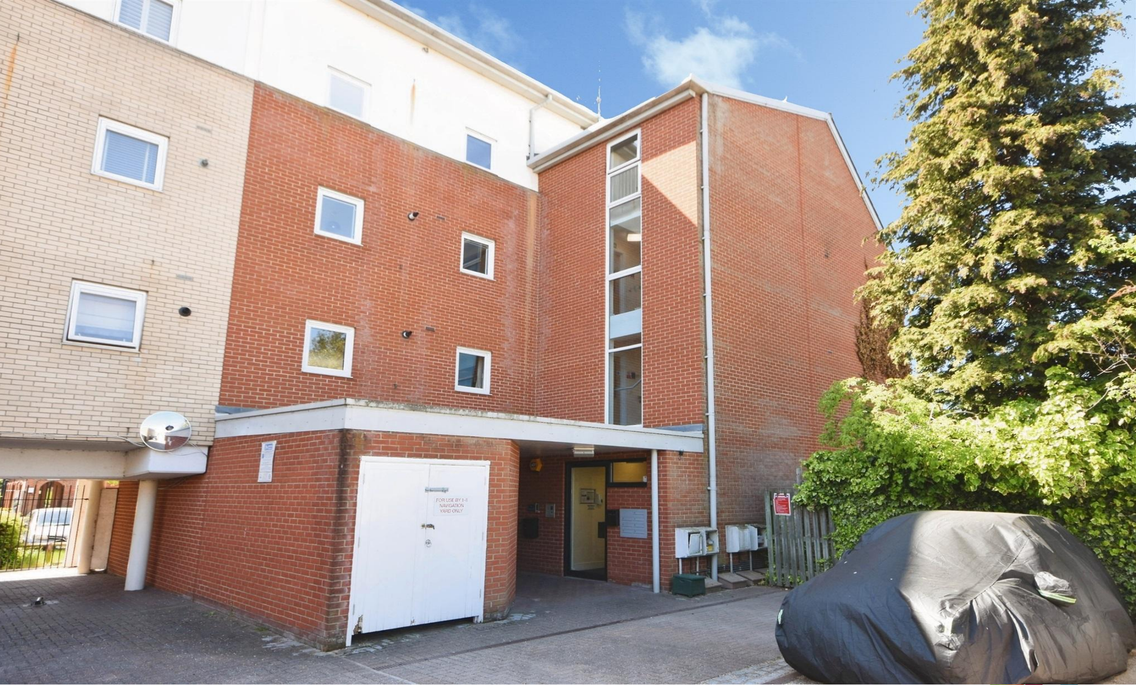
Navigation Yard, Chelmsford CM2 6HZ