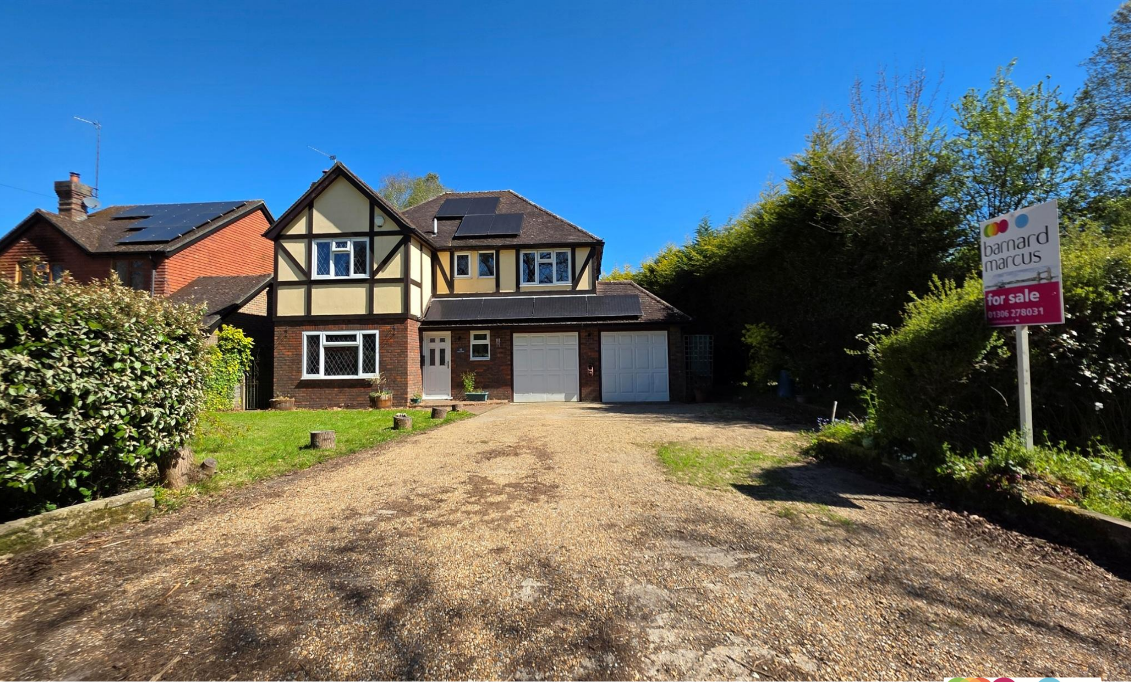
Paynes Green Cottages Weare Street, Ockley Dorking RH5 5NH