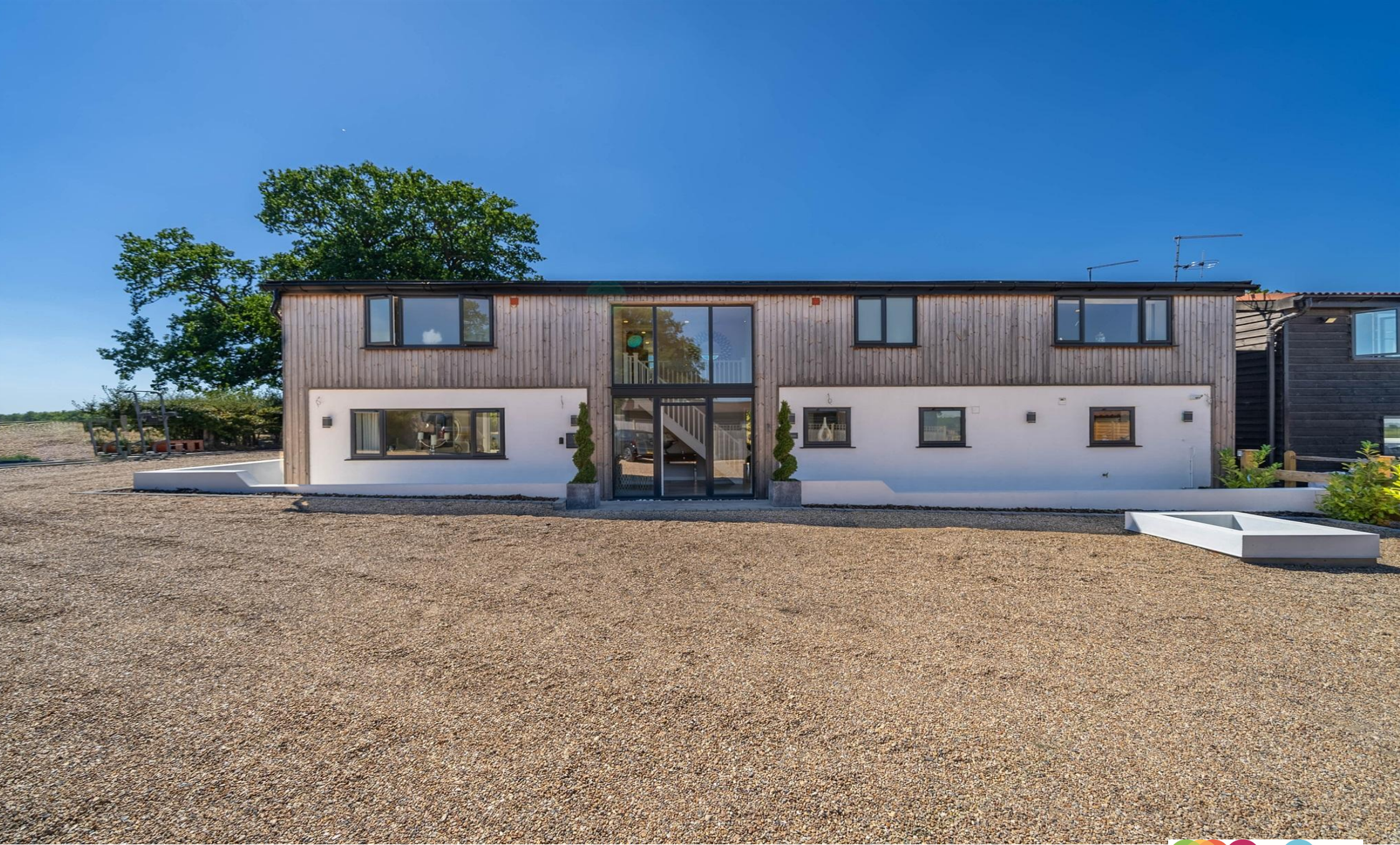
The Hay Barn Partridge Lane, Newdigate Dorking RH5 5BU