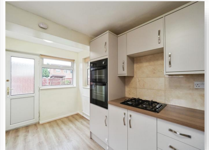
Kensington Avenue, Loughborough