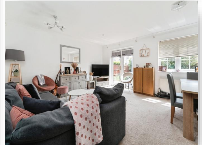
Ashbeach Drove, Ramsey PE26 2TG